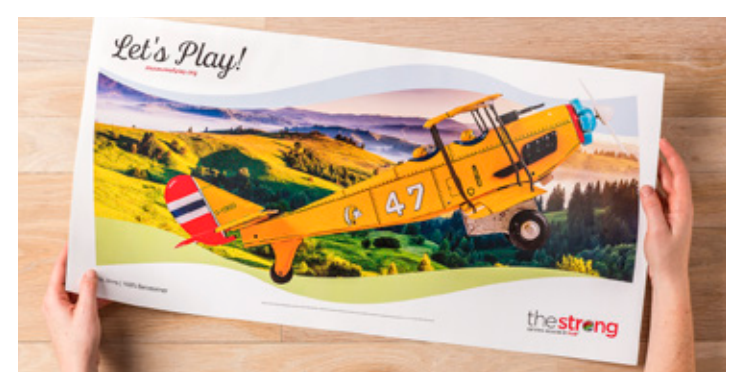
Extra-long sheet printing—maximum paper size 13 x 26" (330 x 660 mm)

It all adds up to better margins, higher profits and the ability to grow strategically with a single, future-proof investment.